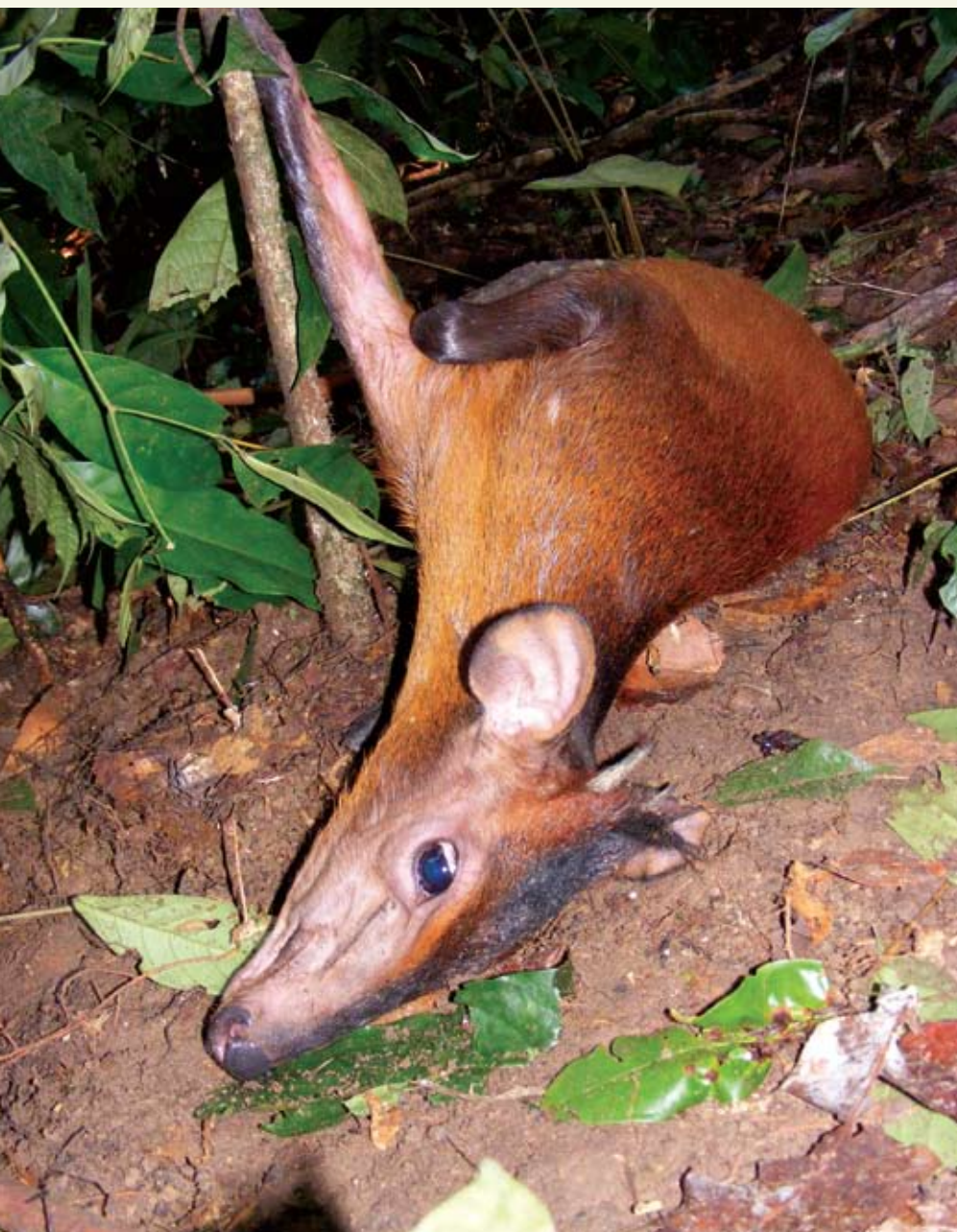
Black fronted duiker in a metal snare trap in the forests of Kailo Territory, Maniema Province, Democratic Republic of Congo (DRC).

The provincial governor took the podium for the closing remarks. “I want you all to know that after this presentation of the important flora and fauna of our province of Maniema, I plan to do my part to preserve it.” He paused.