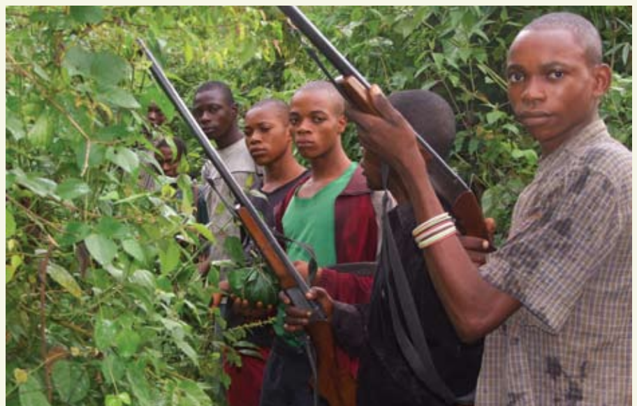
A group of hunters from the Bangengele village of Tshombe Kilima now must walk a full day to their hunting grounds carrying 12 gauge shotguns and metal cable snare traps.

Our field season in 2010 began with organisation of the tambiko ceremonies. A single ceremony became three, thus covering ethnic divisions within the landscape. The TL2 Project provided logistics and food, but the ceremonies were in the hands of the elders. There was dancing, singing, chanting and lots of talking. At the meetings we organise, we give Powerpoint presentations to explain the implications of overhunting and the importance of protected areas. At the tambiko ceremonies, we said nothing. We listened, as did the provincial administrators from Kindu, who joined us