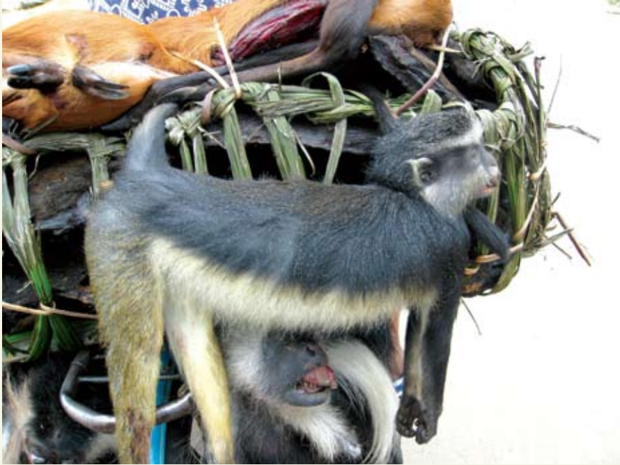
A subspecies endemic to the TL2 landscape, Cercopithecus mona elegans , is carried along with Black and white colobus ( Colobus angolensis ) to the market in Kindu on the back of a bicycle.

was especially affected as most of Kindu's wild meat originated in the TL2 region, funnelling into the city along bicycle tracks that traverse the Kasuku River, an otherwise impassable barrier, at two crossing points. Following the governor's lead, the mayor of Kindu joined forces with the TL2 Project in a media campaign to inform Kindu's consumers of the upcoming ban on wild meat. Several of Kindu's wild meat vendors, who had already begun to see declining supplies of their produce, joined forces in the outreach. As the date for the hunting ban approached, we placed monitors at the Kasuku crossings. There was essentially no legal enforcement, so we were doubtful that there would be widespread compliance.