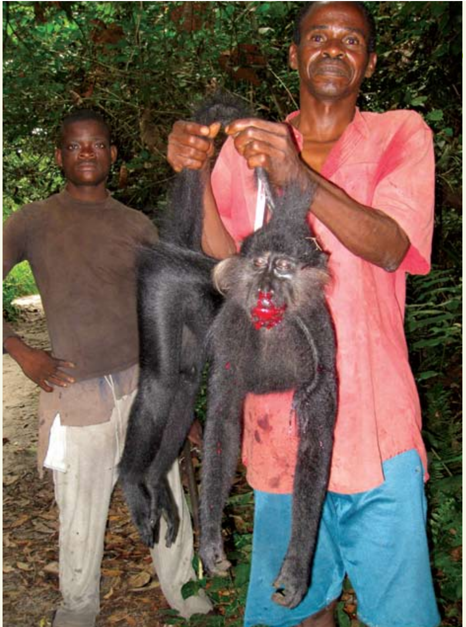
Along the road that leads from Kindu to the Lomami River, a villager and his son return to their village with a Black mangabey killed with a 12 gauge shotgun.

Where rule of law is weak, we have tried to reach out to organise and motivate people from across Congolese